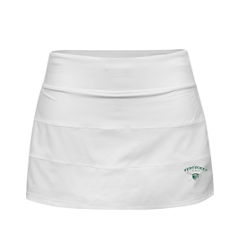
$72.99 lululemon Women's Pace Rival Mid Rise Skirt