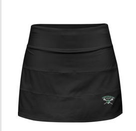
$72.99 lululemon Women's Pace Rival Mid Rise Skirt