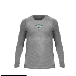
$89.99 | Iululemon Metal Vent Tech Long Sleeve 2.0 Available in 1 other