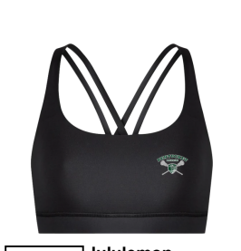
$58.99 lululemon Women's Energy